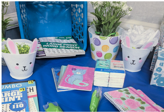
Some items for the Northside Neighborhood House

Eligible SCCU members who have opted in to Courtesy Pay have previously enjoyed coverage for checks, on-us checks at the teller counter, and ACH transactions. Soon, we will add debit card and ATM transactions to the list of transaction types covered by Courtesy Pay. These new coverage options will be opt-in only , so watch your mailbox for more information.